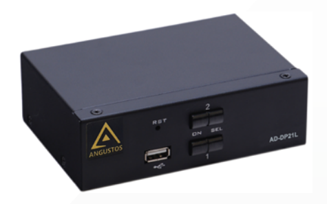
AD-DP21L FRONT VIEW

In addition, the AD-DP21L included the computer selection via front panel pushbuttons, hotkeys combination. With all of the technology involved, the AD-DP21L Desktop KVM Switch has gone beyond the expectations and requirements for a modern digital usage, which including: small size - space optimization, exceptional display quality, easy to install, extreme versatility.