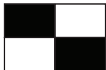
MATRIX SWITCH *WITH SEAMLESS