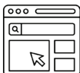
WEB GUI CONTROL