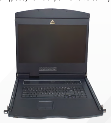
AL-UV916L FRONT VIEW

In addition, the AL-UV916L included an additional hot-pluggable USB port that supports other keyboard and mouse for back-up. With all of the technology involved, the AL-UV916L LCD KVM Switch has gone beyond the expectations and requirements for a modern Data Center use, which including: short space optimization, exceptional display quality, easy to install, extreme versatility.