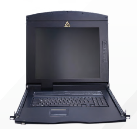
AL-UV708L FRONT VIEW

In addition, the AL-UV708L included an additional hot-pluggable USB port that supports other keyboard and mouse for back-up. With all of the technology involved, the AL-UV708L LCD KVM Switch has gone beyond the expectations and requirements for a modern Data Center use, which including: short space optimization, exceptional display quality, easy to install, extreme versatility.