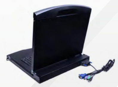
AL-V700L REAR VIEW