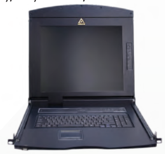
AL-V700L FRONT VIEW

In addition, the AL-V700L included an additional hot-pluggable USB port that supports other keyboard and mouse for back-up. With all of the technology involved, the AL-V700L LCD KVM Console has gone beyond the expectations and requirements for a modern Data Center use, which including: short space optimization, exceptional display quality, easy to install, extreme versatility.