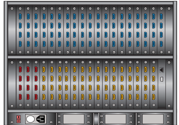
ACVW4-7672 : 11U chassis