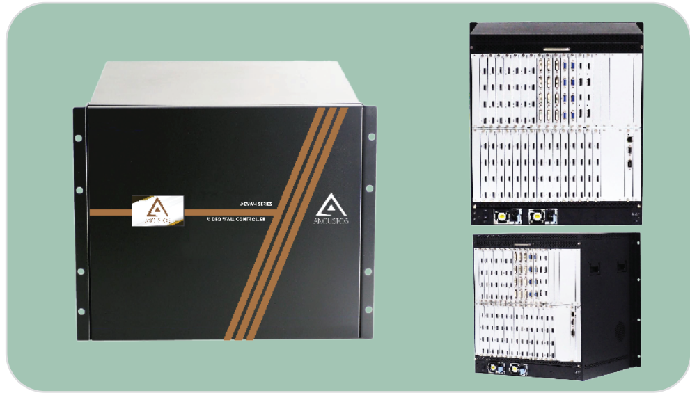
*All Pictures shown are for illustration purpose only. Actual product may vary due to product enhancement. ALL PRODUCT, PRODUCT SPECIFICATIONS AND DATA ARE SUBJECT TO CHANGE WITHOUT NOTICE.