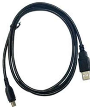
USB-C TO USB-B CABLE