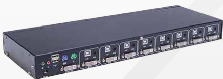
AR-D08L REAR VIEW