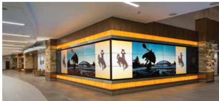
SHOPPING - RETAIL