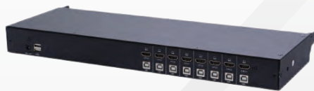
AR-H08L REAR VIEW