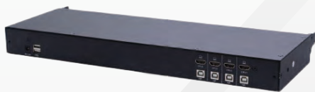
AR-HO4L REAR VIEW