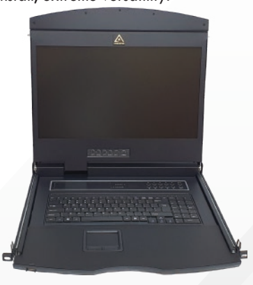
AL-V916L FRONT VIEW

In addition, the AL-V916L included an additional hot-pluggable USB port that supports other keyboard and mouse for backup. With all of the technology involved, the AL-V916L LCD KVM Switch has gone beyond the expectations and requirements for a modern Data Center use, which including: short space optimization, exceptional display quality, easy to install, extreme versatility.