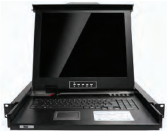
AL-V908P FRONT VIEW

In addition, the AL-V908P included an additional hot-pluggable USB port that supports other keyboard and mouse for back-up. With all of the technology involved, the AL-V908P LCD KVM Console has gone beyond the expectations and requirements for a modern Data Center use, which including : short space optimization, exceptional display quality, easy to install, extreme versatility.