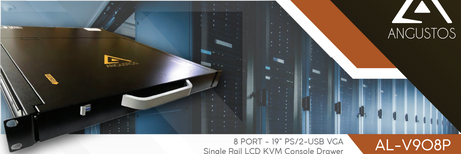
8 PORT - 19" PS/2-USB VGA Single Rail LCD KVM Console Drawer