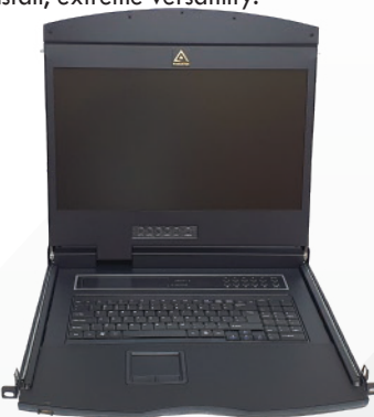
AL-V908L FRONT VIEW

In addition, the AL-V908L included an additional hot-pluggable USB port that supports other keyboard and mouse for back-up. With all of the technology involved, the AL-V908L LCD KVM Switch has gone beyond the expectations and requirements for a modern Data Center use, which including: short space optimization, exceptional display quality, easy to install, extreme versatility.