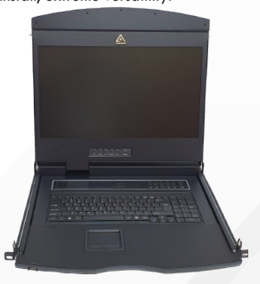
AL-V904L FRONT VIEW

In addition, the AL-V904L included an additional hot-pluggable USB port that supports other keyboard and mouse for backup. With all of the technology involved, the AL-V904L LCD KVM Swtich has gone beyond the expectations and requirements for a modern Data Center use, which including: short space optimization, exceptional display quality, easy to install, extreme versatility.