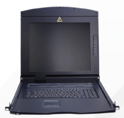
AL-V708L FRONT VIEW

In addition, the AL-V708L included an additional hot-pluggable USB port that supports other keyboard and mouse for back-up. With all of the technology involved, the AL-V708L LCD KVM Switch has gone beyond the expectations and requirements for a modern Data Center use, which including: short space optimization, exceptional display quality, easy to install, extreme versatility.