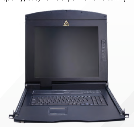
AL-V704L FRONT VIEW

In addition, the AL-V704L included an additional hot-pluggable USB port that supports other keyboard and mouse for backup. With all of the technology involved, the AL-V704L LCD KVM Switch has gone beyond the expectations and requirements for a modern Data Center use, which including: short space optimization, exceptional display quality, easy to install, extreme versatility.