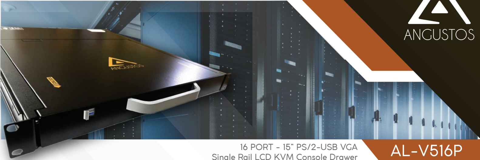
16 PORT - 15" PS/2-USB VGA Single Rail LCD KVM Console Drawer