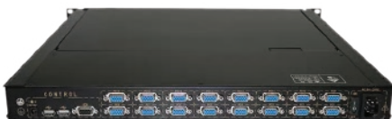
AL-V508P REAR VIEW