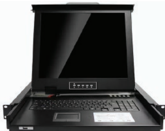
AL-V516P FRONT VIEW

We are committed to established international standards. We can provide customers with complete Datacenter solutions as well as OEM/ODM services. We can cover even from medium to small business, factory & industrial, military & government, home office & personal use.