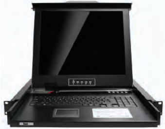
AL-V508P FRONT VIEW

In addition, the AL-V508P included an additional hot-pluggable USB port that supports other keyboard and mouse for back-up. With all of the technology involved, the AL-V508P LCD KVM Console has gone beyond the expectations and requirements for a modern Data Center use, which including : short space optimization, exceptional display quality, easy to install, extreme versatility.