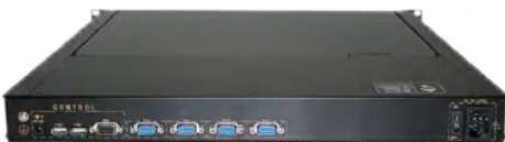
AL-V504P REAR VIEW