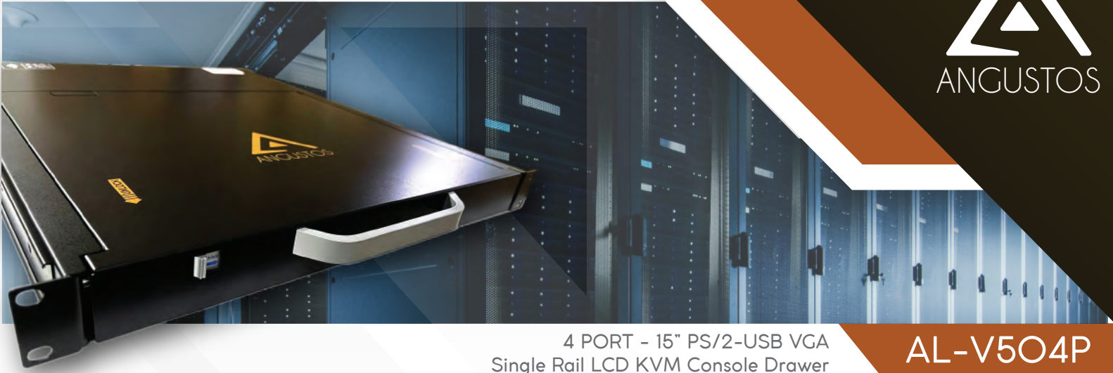
4 PORT - 15" PS/2-USB VGA Single Rail LCD KVM Console Drawer