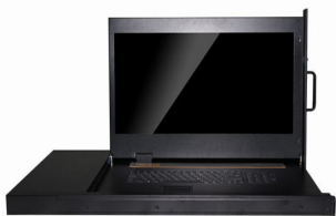
AL-V2116P FRONT VIEW

In addition, the AL-V2116P included an additional hot-pluggable USB port that supports other keyboard and mouse for back-up. With all of the technology involved, the AL-V2116P LCD KVM Console has gone beyond the expectations and requirements for a modern Data Center use, which including : short space optimization, exceptional display quality, easy to install, extreme versatility.