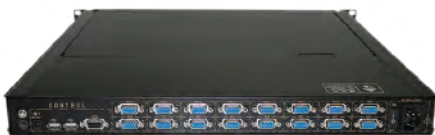
AL-V2116P REAR VIEW