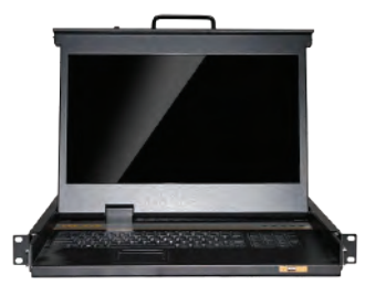
AL-V18516P FRONT VIEW

In addition, the AL-V18516P included an additional hot-pluggable USB port that supports other keyboard and mouse for back-up. With all of the technology involved, the AL-V18516P LCD KVM Console has gone beyond the expectations and requirements for a modern Data Center use, which including: short space optimization, exceptional display quality, easy to install, extreme versatility.