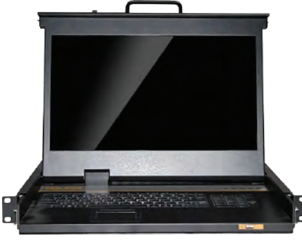
AL-V1850P FRONT VIEW

In addition, the AL-V1850P included an additional hot-pluggable USB port that supports other keyboard and mouse for back-up. With all of the technology involved, the AL-V1850P LCD KVM Console has gone beyond the expectations and requirements for a modern Data Center use, which including: short space optimization, exceptional display quality, easy to install, extreme versatility.