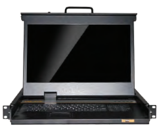
AL-V17316P FRONT VIEW

In addition, the AL-V17316P included an additional hot-pluggable USB port that supports other keyboard and mouse for back-up. With all of the technology involved, the AL-V17316P LCD KVM Console has gone beyond the expectations and requirements for a modern Data Center use, which including: short space optimization, exceptional display quality, easy to install, extreme versatility.