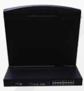
AL-UV9416iL REAR VIEW