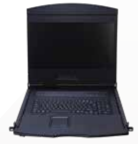
AL-UV9416iL FRONT VIEW

In addition, the AL-UV9416iL included 2 additional hot-pluggable USB port that supports other keyboard and mouse for back-up. With all of the technology involved, the AL-UV9416iL Switch has gone beyond the expectations and requirements for a modern Data Center use, which including: short space optimization, exceptional display quality, easy to install, extreme versatility.