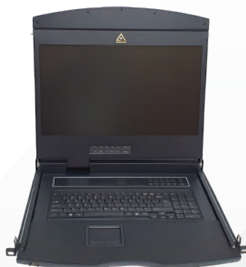
AL-UV932L FRONT VIEW

In addition, the AL-UV932L included an additional hot-pluggable USB port that supports other keyboard and mouse for back-up. With all of the technology involved, the AL-UV932L LCD KVM Switch has gone beyond the expectations and requirements for a modern Data Center use, which including : short space optimization, exceptional display quality, easy to install, extreme versatility.