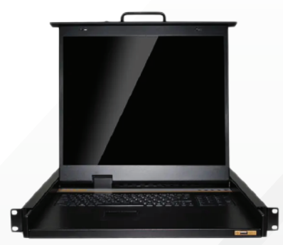
AL-UV916P FRONT VIEW

In addition, the AL-UV916P included an additional hot-pluggable USB port that supports other keyboard and mouse for back-up. With all of the technology involved, the AL-UV916P LCD KVM Swtich has gone beyond the expectations and requirements for a modern Data Center use, which including: short space optimization, exceptional display quality, easy to install, extreme versatility.