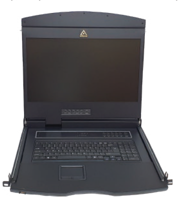
AL-UV916L FRONT VIEW

In addition, the AL-UV916L included an additional hot-pluggable USB port that supports other keyboard and mouse for back-up. With all of the technology involved, the AL-UV916L LCD KVM Switch has gone beyond the expectations and requirements for a modern Data Center use, which including: short space optimization, exceptional display quality, easy to install, extreme versatility.