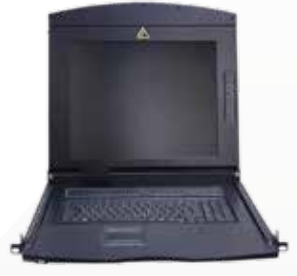
AL-UV7416iL FRONT VIEW

In addition, the AL-UV7416iL included 2 additional hot-pluggable USB port that supports other keyboard and mouse for back-up. With all of the technology involved, the AL-UV7416iL Switch has gone beyond the expectations and requirements for a modern Data Center use, which including: short space optimization, exceptional display quality, easy to install, extreme versatility.