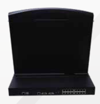
AL-UV7416iL REAR VIEW