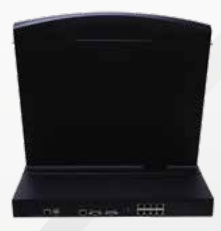
AL-UV7408iL REAR VIEW