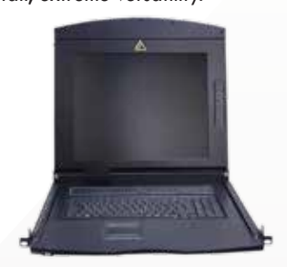
AL-UV7408iL FRONT VIEW

In addition, the AL-UV7408iL included 2 additional hot-pluggable USB port that supports other keyboard and mouse for back-up. With all of the technology involved, the AL-UV7408iL Switch has gone beyond the expectations and requirements for a modern Data Center use, which including: short space optimization, exceptional display quality, easy to install, extreme versatility.