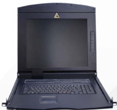
AL-UV732L FRONT VIEW

In addition, the AL-UV732L included an additional hot-pluggable USB port that supports other keyboard and mouse for back-up. With all of the technology involved, the AL-UV732L LCD KVM Switch has gone beyond the expectations and requirements for a modern Data Center use, which including : short space optimization, exceptional display quality, easy to install, extreme versatility.