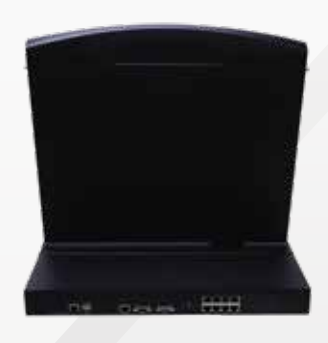
AL-UV7208iL REAR VIEW