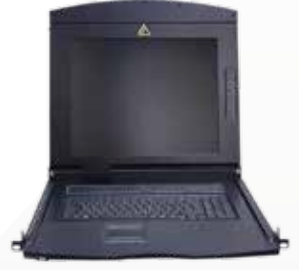
AL-UV7208iL FRONT VIEW

In addition, the AL-UV7208iL included 2 additional hot-pluggable USB port that supports other keyboard and mouse for back-up. With all of the technology involved, the AL-UV7208iL Switch has gone beyond the expectations and requirements for a modern Data Center use, which including: short space optimization, exceptional display quality, easy to install, extreme versatility.