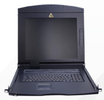
AL-UV708L FRONT VIEW

In addition, the AL-UV708L included an additional hot-pluggable USB port that supports other keyboard and mouse for back-up. With all of the technology involved, the AL-UV708L LCD KVM Switch has gone beyond the expectations and requirements for a modern Data Center use, which including: short space optimization, exceptional display quality, easy to install, extreme versatility.