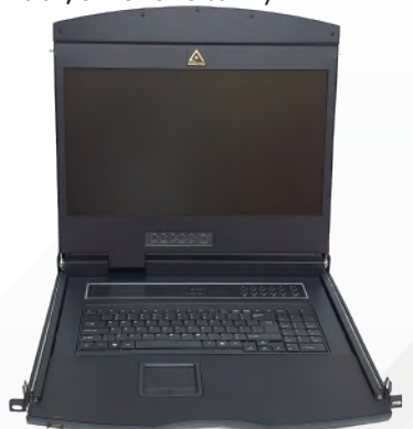
AL-H916L FRONT VIEW

In addition, the AL-H916L included an additional hot-pluggable USB port that supports other keyboard and mouse for backup. With all of the technology involved, the AL-H916L LCD KVM Swtich has gone beyond the expectations and requirements for a modern Data Center use, which including: short space optimization, exceptional display quality, easy to install, extreme versatility.