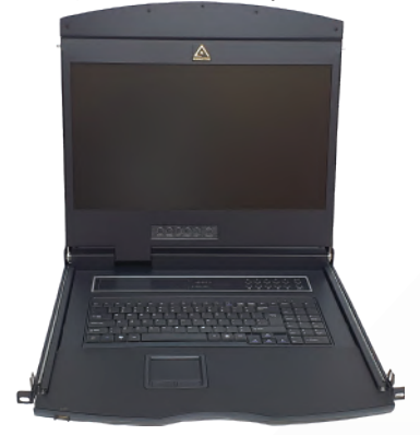
AL-H908L FRONT VIEW

In addition, the AL-H908L included an additional hot-pluggable USB port that supports other keyboard and mouse for backup. With all of the technology involved, the AL-H908L LCD KVM Swtich has gone beyond the expectations and requirements for a modern Data Center use, which including: short space optimization, exceptional display quality, easy to install, extreme versatility.