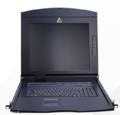
AL-H716L FRONT VIEW

In addition, the AL-H716L included an additional hot-pluggable USB port that supports other keyboard and mouse for back-up. With all of the technology involved, the AL-H716L LCD KVM Swtich has gone beyond the expectations and requirements for a modern Data Center use, which including: short space optimization, exceptional display quality, easy to install, extreme versatility.