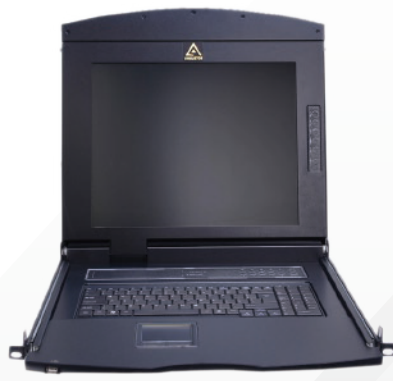
AL-H716L FRONT VIEW

In addition, the AL-H716L included an additional hot-pluggable USB port that supports other keyboard and mouse for backup. With all of the technology involved, the AL-H716L LCD KVM Swtich has gone beyond the expectations and requirements for a modern Data Center use, which including: short space optimization, exceptional display quality, easy to install, extreme versatility.