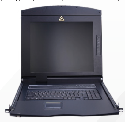
AL-H716L FRONT VIEW

In addition, the AL-H716L included an additional hot-pluggable USB port that supports other keyboard and mouse for back-up. With all of the technology involved, the AL-H716L LCD KVM Swtich has gone beyond the expectations and requirements for a modern Data Center use, which including: short space optimization, exceptional display quality, easy to install, extreme versatility.