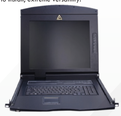
AL-H708L FRONT VIEW

In addition, the AL-H708L included an additional hot-pluggable USB port that supports other keyboard and mouse for backup. With all of the technology involved, the AL-H708L LCD KVM Swtich has gone beyond the expectations and requirements for a modern Data Center use, which including: short space optimization, exceptional display quality, easy to install, extreme versatility.