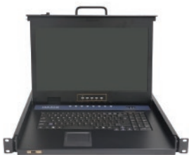
AL-H1738P REAR VIEW

In addition, the AL-H1738P included an additional hot-pluggable USB port that supports other keyboard and mouse for back-up. With all of the technology involved, the AL-H1738P LCD KVM Switch has gone beyond the expectations and requirements for a modern Data Center use, which including : short space optimization, exceptional display quality, easy to install, extreme versatility.