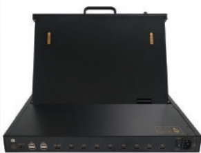
AL-H1738P REAR VIEW