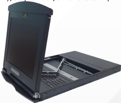
AL-DVT1708L FRONT VIEW

In addition, the AL-DVT1708L included an additional hot-pluggable USB port that supports other keyboard and mouse for back-up. With all of the technology involved, the AL-DVT1708L LCD KVM Switch has gone beyond the expectations and requirements for a modern Data Center use, which including : short space optimization, exceptional display quality, easy to install, extreme versatility.