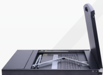
AL-DVT1708L SIDE VIEW