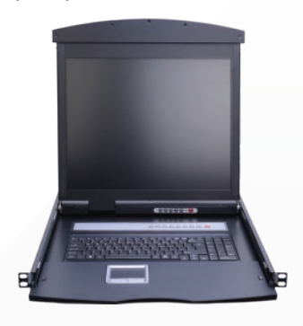
AL-DV908L FRONT VIEW

In addition, the AL-DV908L included an additional hot-pluggable USB port that supports other keyboard and mouse for back-up. With all of the technology involved, the AL-DV908L LCD KVM Switch has gone beyond the expectations and requirements for a modern Data Center use, which including: short space optimization, exceptional display quality, easy to install, extreme versatility.