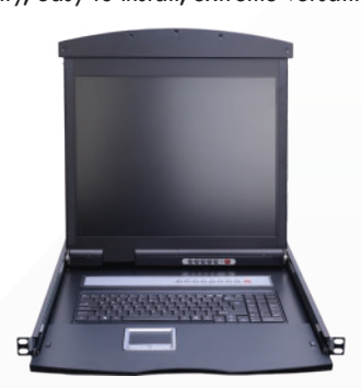
AL-DV908L FRONT VIEW

In addition, the AL-DV908L included an additional hot-pluggable USB port that supports other keyboard and mouse for back-up. With all of the technology involved, the AL-DV908L LCD KVM Switch has gone beyond the expectations and requirements for a modern Data Center use, which including: short space optimization, exceptional display quality, easy to install, extreme versatility.