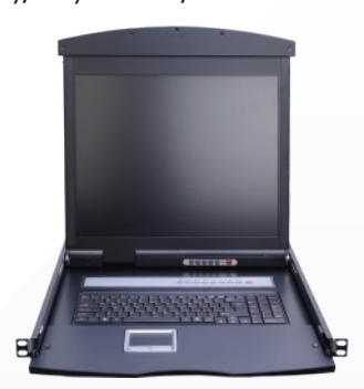
AL-DV904L FRONT VIEW

In addition, the AL-DV904L included an additional hot-pluggable USB port that supports other keyboard and mouse for back-up. With all of the technology involved, the AL-DV904L LCD KVM Switch has gone beyond the expectations and requirements for a modern Data Center use, which including: short space optimization, exceptional display quality, easy to install, extreme versatility.