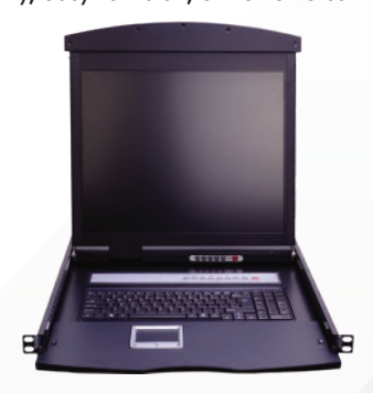
AL-DV900L FRONT VIEW

In addition, the AL-DV900L included an additional hot-pluggable USB port that supports other keyboard and mouse for back-up. With all of the technology involved, the AL-DV900L LCD KVM Console has gone beyond the expectations and requirements for a modern Data Center use, which including: short space optimization, exceptional display quality, easy to install, extreme versatility.