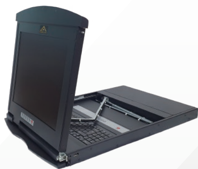
AL-DV716L FRONT VIEW

In addition, the AL-DV716L included an additional hot-pluggable USB port that supports other keyboard and mouse for backup. With all of the technology involved, the AL-DV716L LCD KVM Switch has gone beyond the expectations and requirements for a modern Data Center use, which including: short space optimization, exceptional display quality, easy to install, extreme versatility.