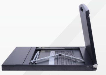
AL-DV716L SIDE VIEW