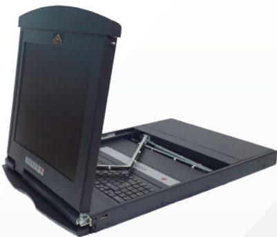
AL-DV716L FRONT VIEW

In addition, the AL-DV716L included an additional hot-pluggable USB port that supports other keyboard and mouse for back-up. With all of the technology involved, the AL-DV716L LCD KVM Switch has gone beyond the expectations and requirements for a modern Data Center use, which including : short space optimization, exceptional display quality, easy to install, extreme versatility.