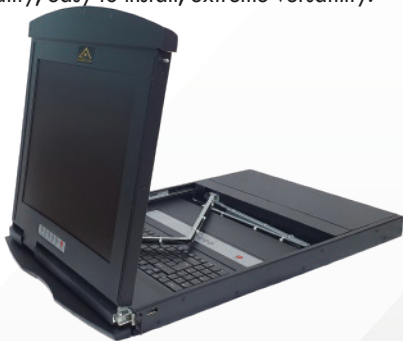
AL-DV708L FRONT VIEW

In addition, the AL-DV708L included an additional hot-pluggable USB port that supports other keyboard and mouse for back-up. With all of the technology involved, the AL-DV708L LCD KVM Switch has gone beyond the expectations and requirements for a modern Data Center use, which including : short space optimization, exceptional display quality, easy to install, extreme versatility.