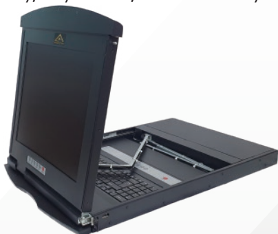
AL-DV704L FRONT VIEW

In addition, the AL-DV704L included an additional hot-pluggable USB port that supports other keyboard and mouse for back-up. With all of the technology involved, the AL-DV704L LCD KVM Switch has gone beyond the expectations and requirements for a modern Data Center use, which including : short space optimization, exceptional display quality, easy to install, extreme versatility.